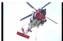
Coast Guard replaces Jetty Tower Jan 6, 2012