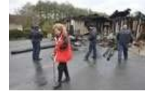
Fairway Drive Fire